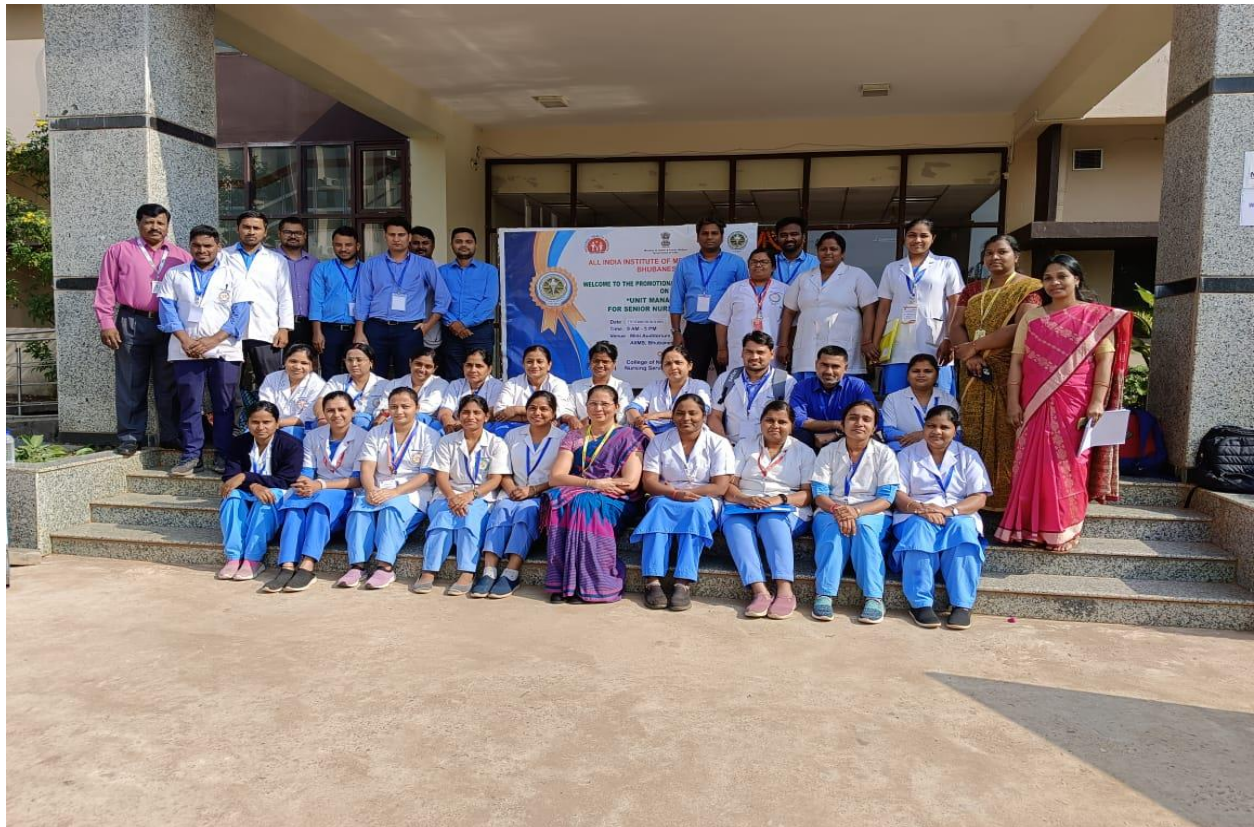
Photo session of the participants