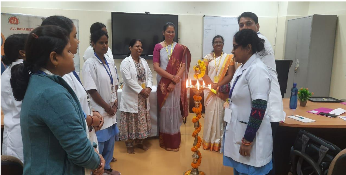
Inauguration of the training program

College of Nursing, AIIMS, Bhubaneswar Organized a 7-days workshop on " Unit Management " for Senior Nursing Officers at AIIMS Bhubaneswar from 11 th December 2023 to 18 th December 2023. Total 30 Senior Nursing Officers actively participated in the workshop. The Objectives of the workshop were to provide standardized information on policies, procedures, protocols and documentation to be followed in the hospital; to develop leadership, managerial, communication and supervisory skills to perform their jobs in improving the quality of health care provided to the public and to facilitate effective staff development. Participants were also given hands on training on handling fire extinguishers and behavioral etiquettes through various role plays and group activities. All the participants expressed high satisfaction at the end of the workshop. The Executive Director distributed the certificates to the participants.