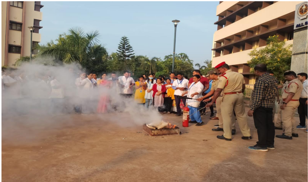
Fire Safety Team carrying out the fire safety drill.